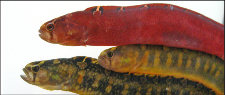
Color and pattern variability