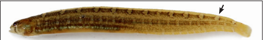
Juvenile (70 mm TL): crescents evident at early age