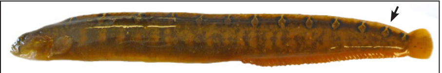
Adult (152 mm TL): namesake crescent patterns along dorsal fin