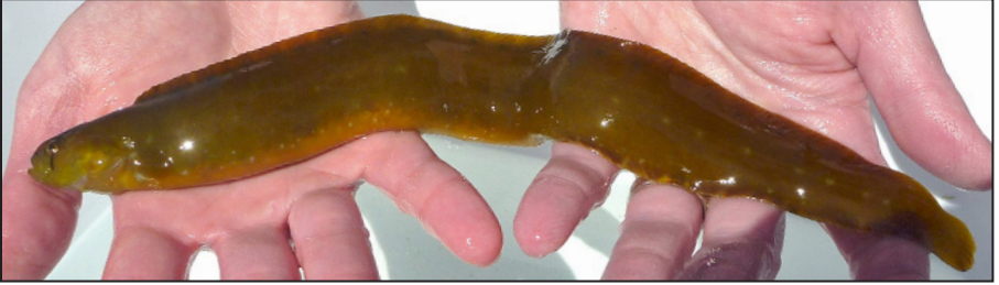
Adult (280 mm TL): large specimens are not common